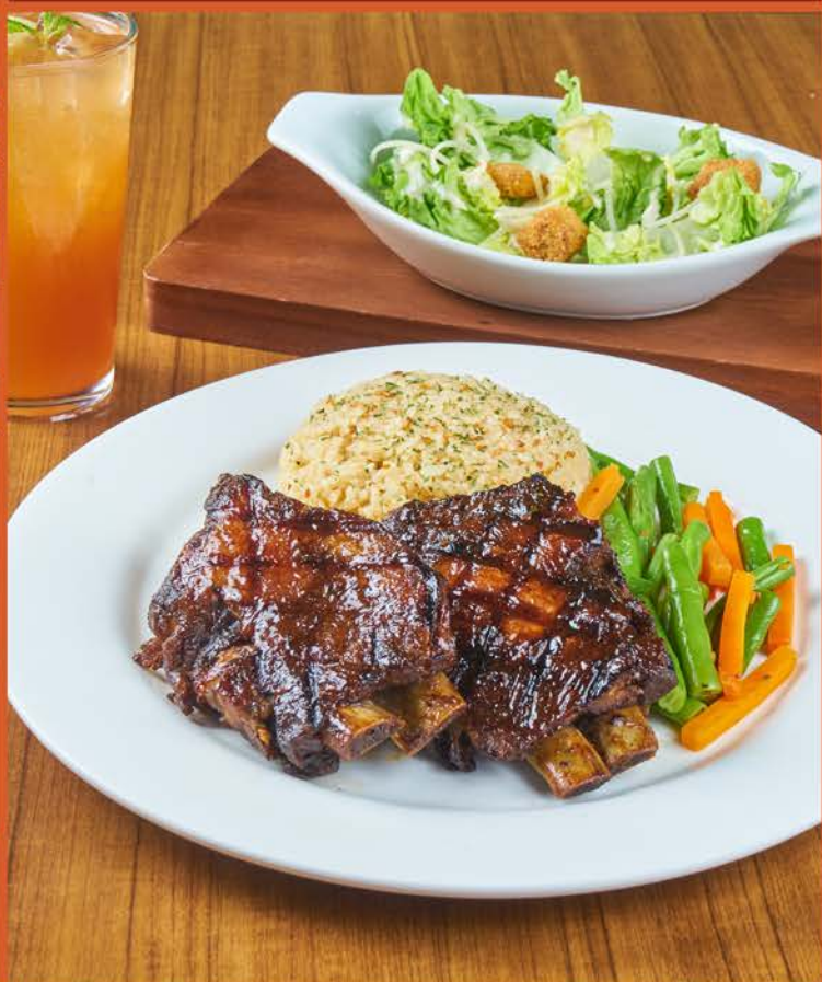
ST LOUIS RIBS