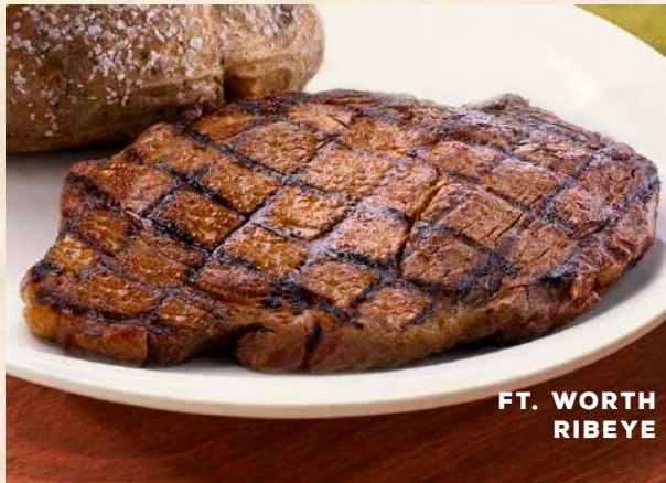
FT. WORTH RIBEYE