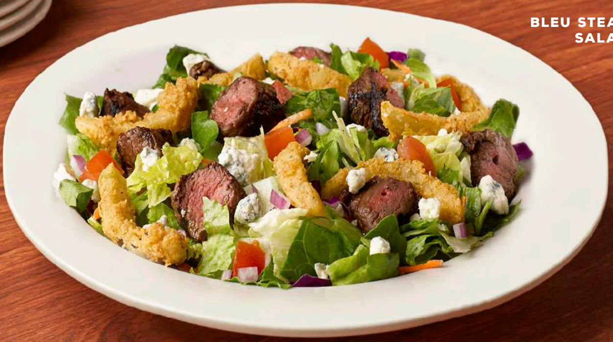
BLEU STEAK SALAD