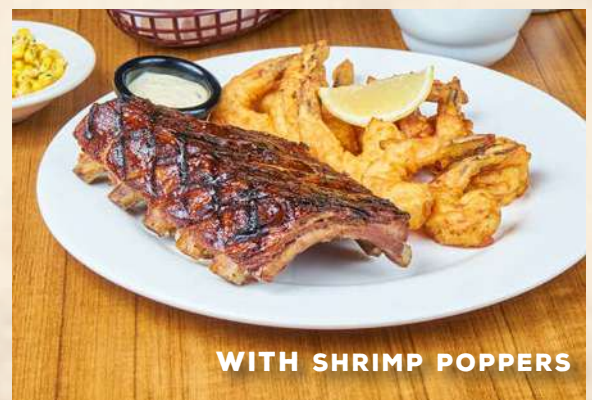
WITH SHRIMP POPPERS