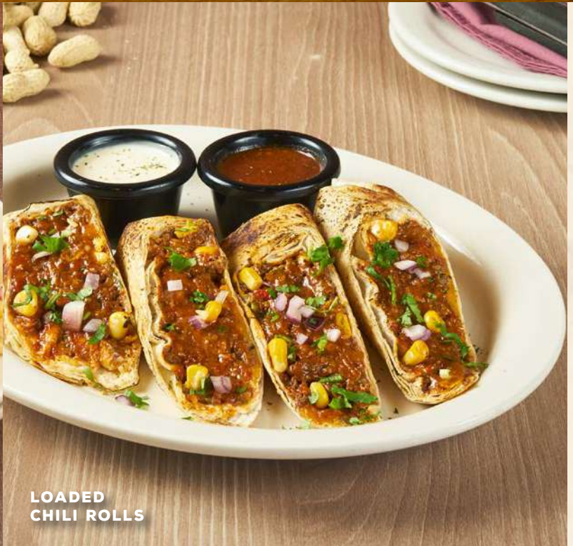
LOADED CHILI ROLLS