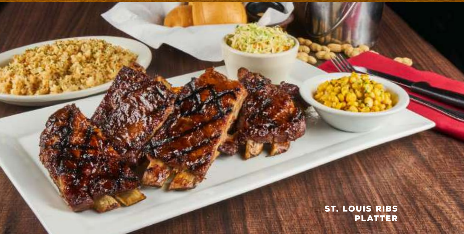
ST. LOUIS RIBS PLATTER