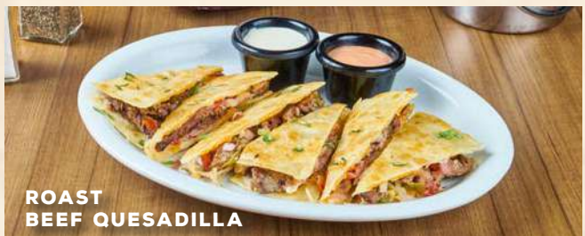
ROAST BEEF QUESADILLA