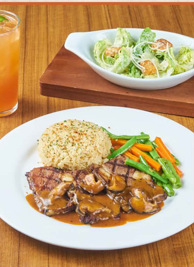
COWBOY ROAST BEEF