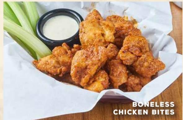
BONELESS CHICKEN BITES