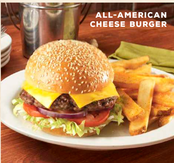
ALL-AMERICAN CHEESE BURGER