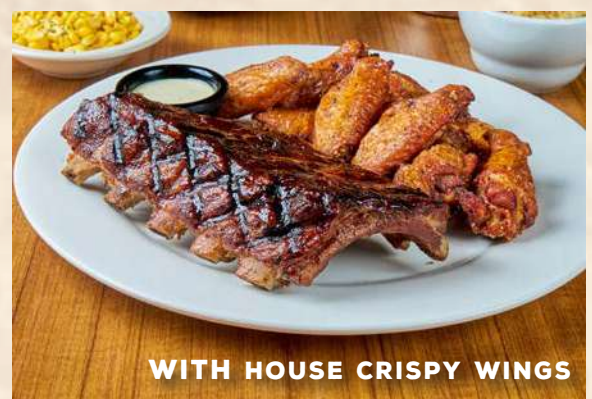
WITH HOUSE CRISPY WINGS