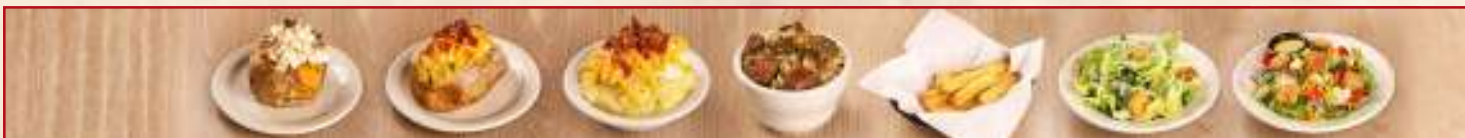
LOADED SWEET POTATO P220