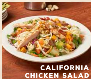
CALIFORNIA CHICKEN SALAD