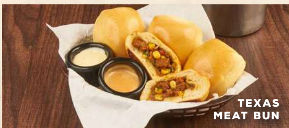
TEXAS MEAT BUN

House bread with cheesy chili meat served with chipotle aioli sauce and ranch dressing.....265