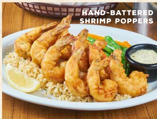
HAND-BATTERED SHRIMP POPPERS

Crispy shrimps handbattered served with housemade tartar sauce.....795