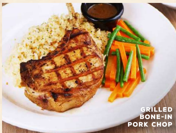
GRILLED BONE-IN PORK CHOP

All white meat chicken strips, hand-dipped in our signature batter and fried to a crispy golden brown. Served with golden honey mustard and seasoned steak fries.....395 / 645