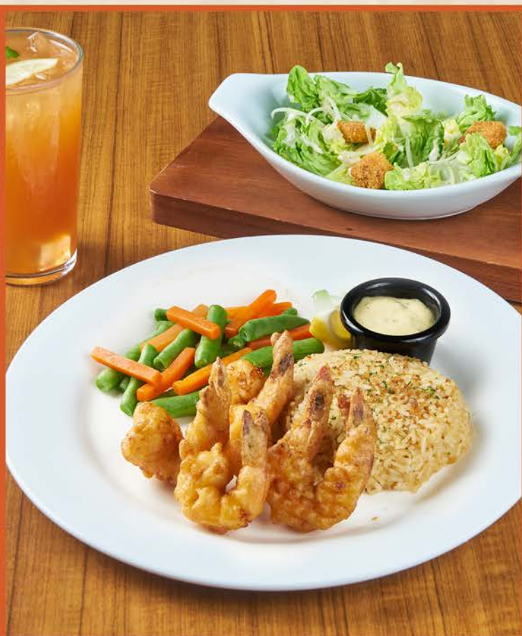
HAND-BATTERED SHRIMP POPPERS