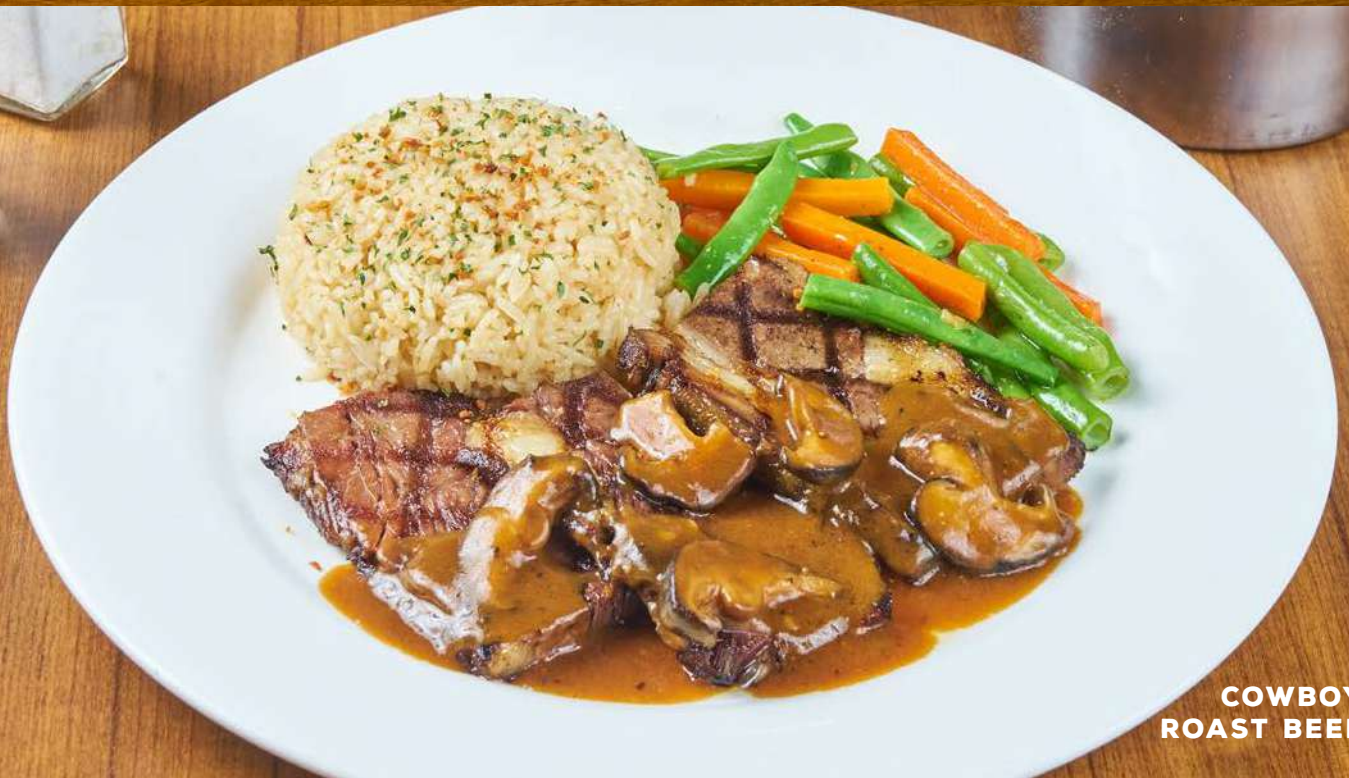
COWBOY ROAST BEEF