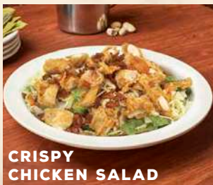
CRISPY CHICKEN SALAD

Hot, crispy strips of chicken piled high on a bed of cold greens with freshly shredded jack and cheddar cheeses, chopped egg, diced tomato and bacon tossed in Made-From-Scratch honey mustard dressing..365 / 595 / 795