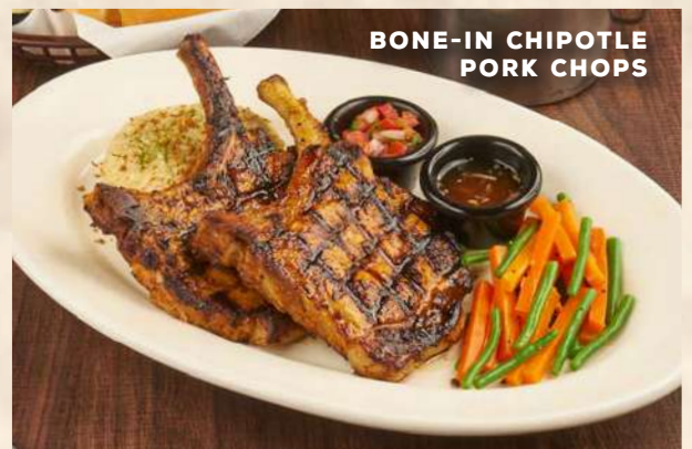
BONE-IN CHIPOTLE PORK CHOPS