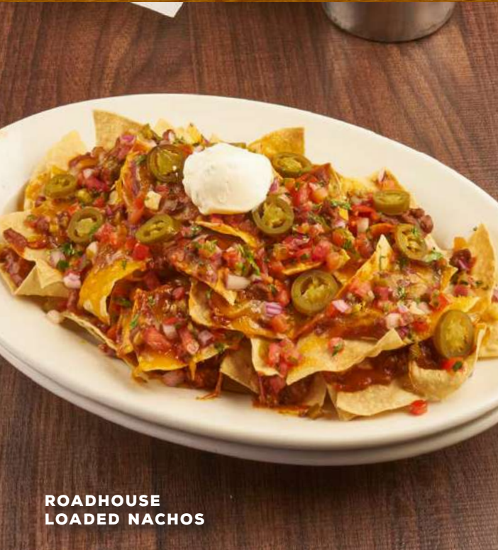
ROADHOUSE LOADED NACHOS