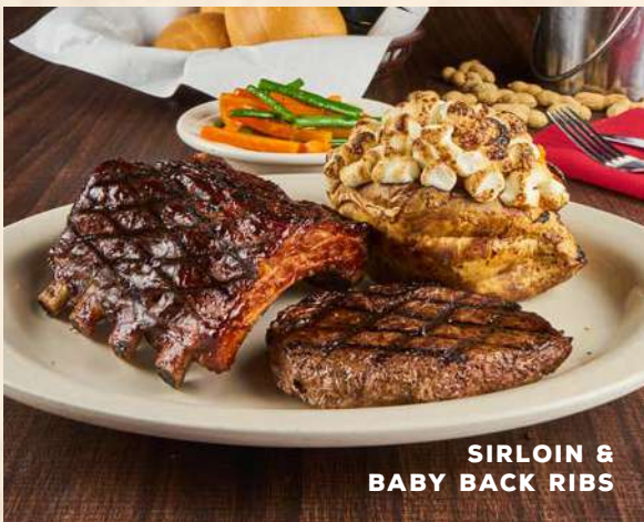
SIRLOIN & BABY BACK RIBS