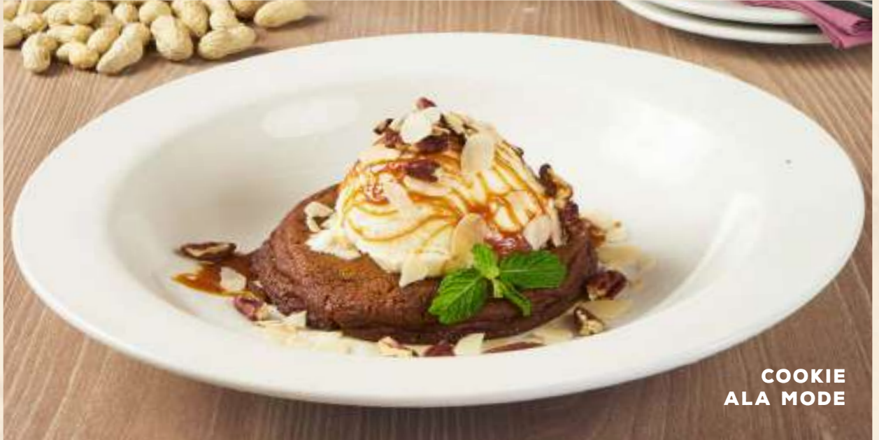
COOKIE ALA MODE