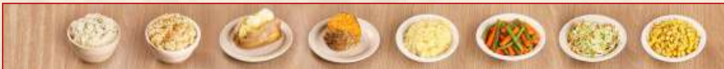
STEAMED RICE P145