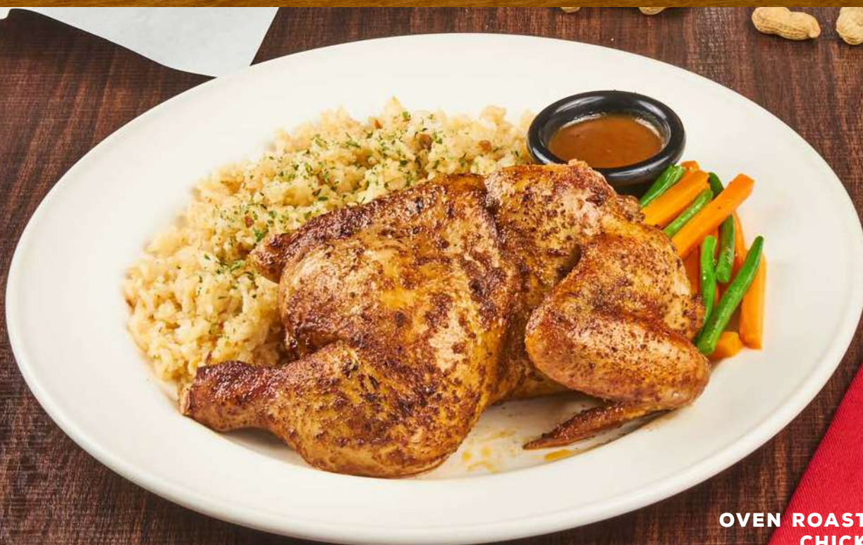
OVEN ROASTED CHICKEN