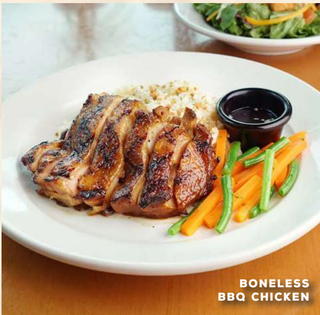
BONELESS BBQ CHICKEN