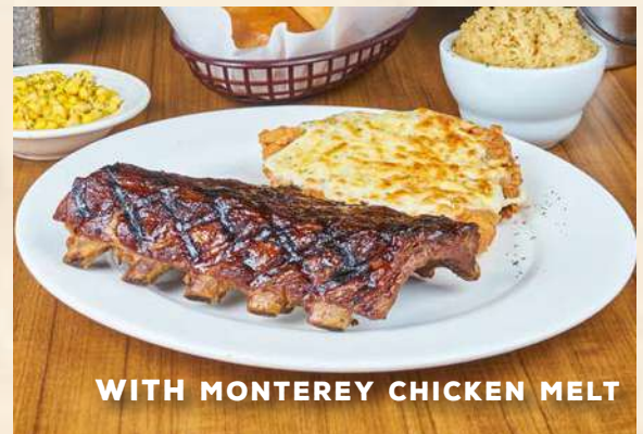
WITH MONTEREY CHICKEN MELT