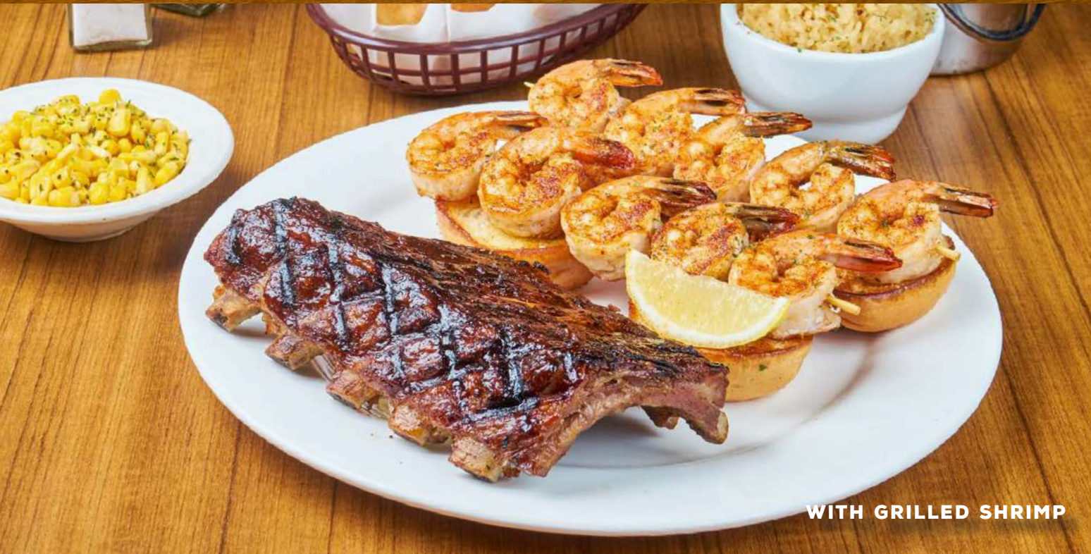
WITH GRILLED SHRIMP