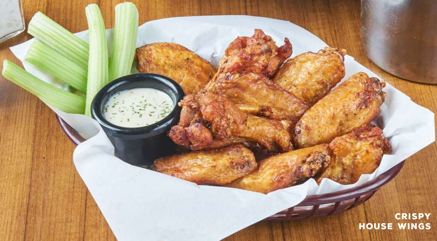
CRISPY HOUSE WINGS