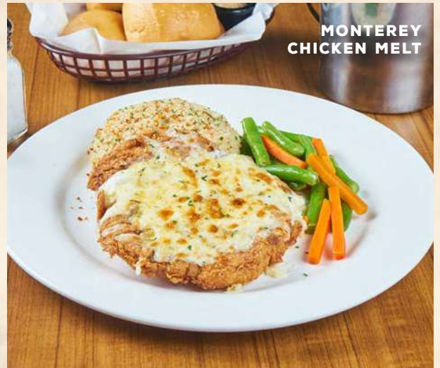
MONTEREY CHICKEN MELT

Choice of hand-battered or grilled chicken breast topped with our house ranch sauce, and grated Monterey jack cheese.....750