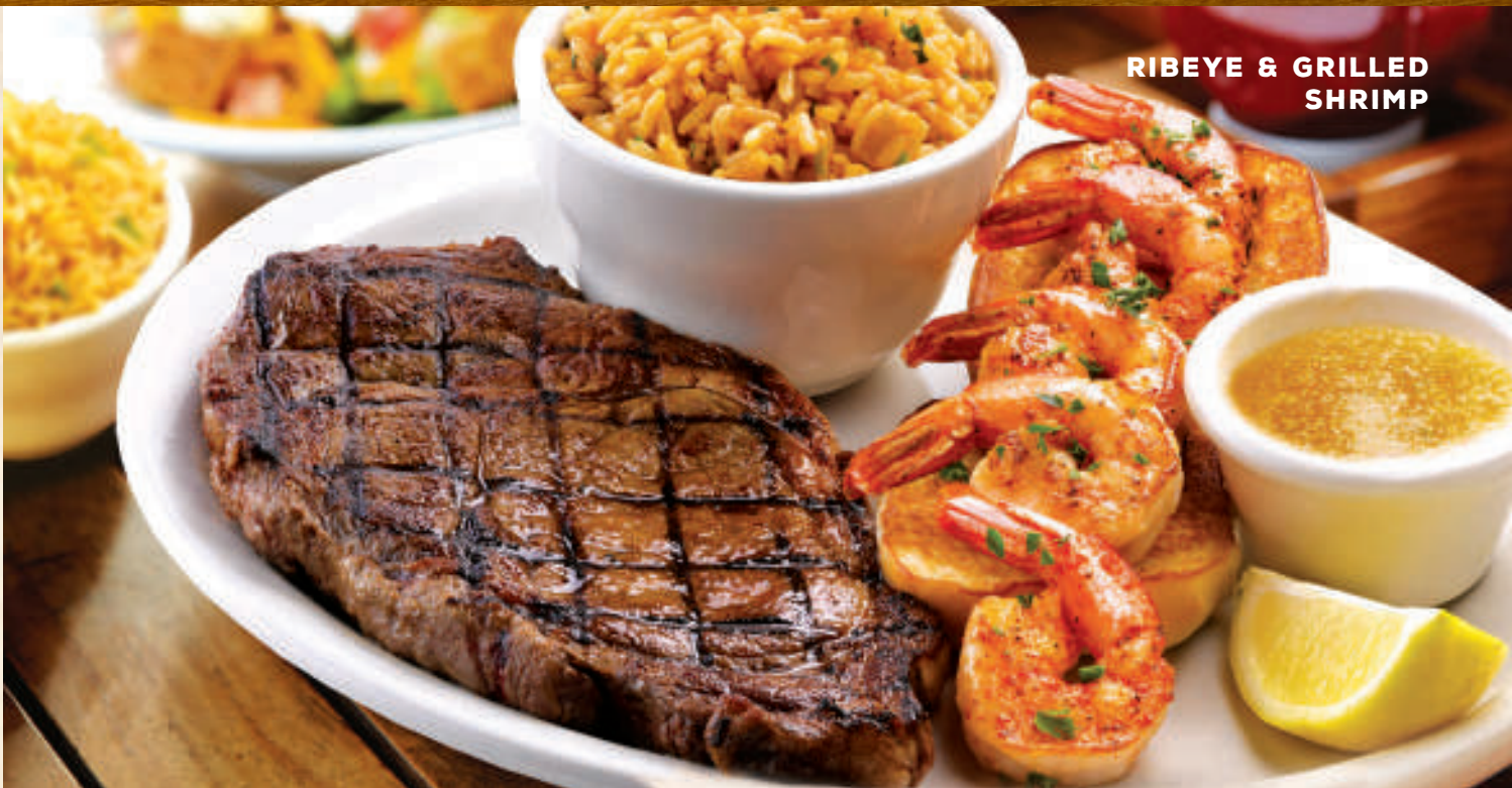
RIBEYE & GRILLED SHRIMP