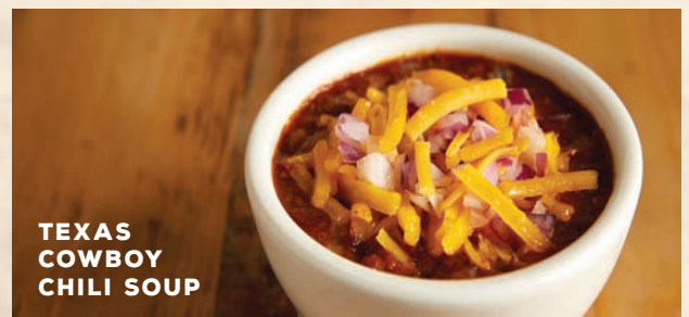
TEXAS COWBOY CHILI SOUP