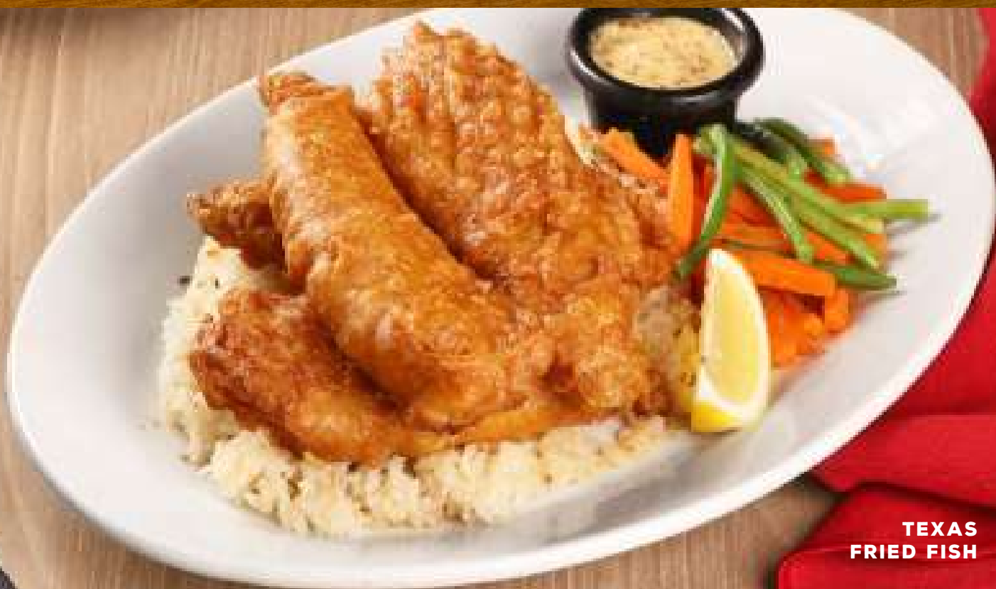
TEXAS FRIED FISH